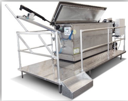
60" high unit

Our Bullet Recovery System has been engineered to provide the highest degree of safety, durability and convenience. No other system comes close in features, performance and value. Offering 28% to 50% greater protection and strength than 3/16" thick tanks. The system will fully contain water under all firing conditions.